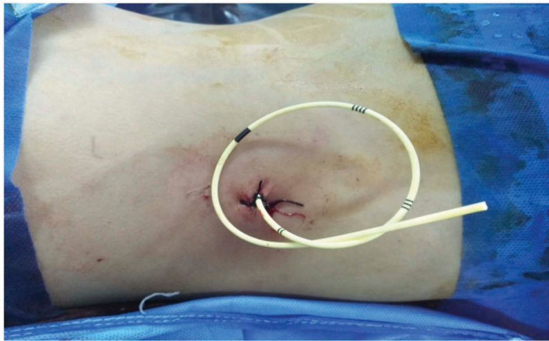
Figure 5. Externalised ureteric catheter at the flank.