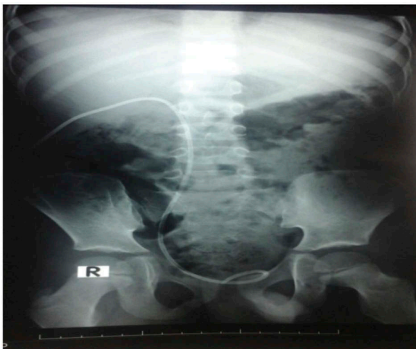
Figure 6. KUB of externalised single J at the flank.

perforation and resolved with JJ stenting and conservative measures; and a nephrostomy tube was inserted in both cases. Two cases (4%) developed a postoperative fever.