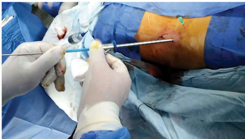
Figure 2. Inserting the 16-F metal sheath over the 16-F dilator.