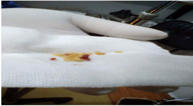
Figure 4. Stones after disintegration.